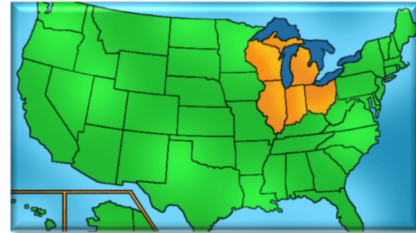
Midwestern United States

Industries: Medical, Industrial, Automotive